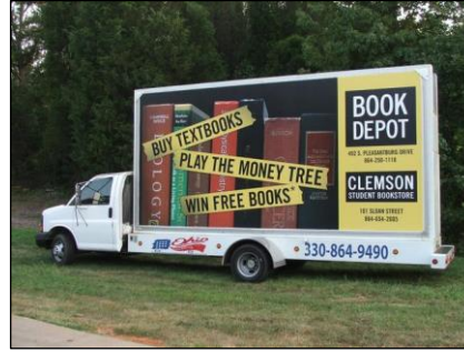
Figure 6.2: Vehicle being used for signage