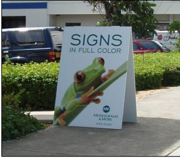
Figure 6.1: Temporary Sign blocking sidewalk