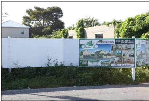
Figure 4.4: Example of Construction Site Signage

Planning permission is not required for these signs, however all such signs shall be removed within seven (7) days after the issuance of a Final Certificate (of Occupancy).