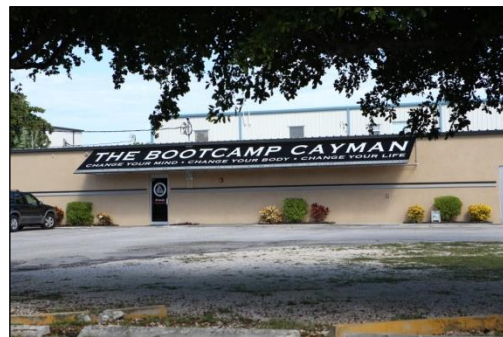
Figure 5.2: Examples of Canopy Signs