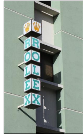
Figure 5.3: Example of a Projecting Sign