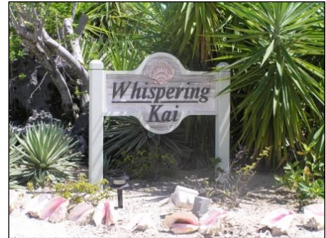
Figure 5.1: Example of a home identifier sign.

Allowable signs include, but are not limited to: address signs, home identifier signs, home occupation signs. Signs may be freestanding (no higher than 3 feet), mounted to a permanent structure or displayed in a window.