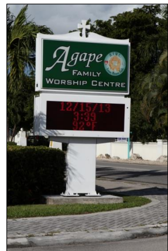
Figure 5.4: Sign with 30% digital display