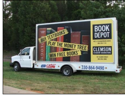
Figure 6.2: Vehicle being used for signage